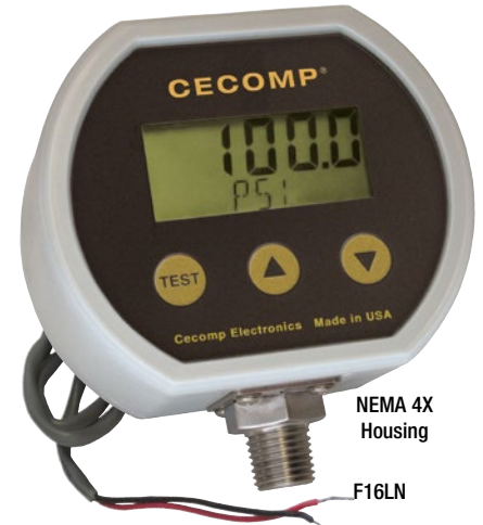
NEMA 4X Housing